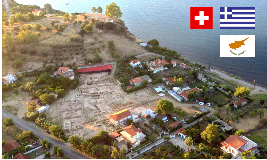
Excavation site at Amarynthos (municipality of Eretria, Euboea Island, Greece)

The Project: In 2023, a group of Swiss and Greek artists followed the excavation campaign at the Sanctuary of Artemis on Euboea, recently discovered by the Swiss School of Archaeology in Greece and the Ephorate of Antiquities of Euboea. Three years later, an impressive 47 works have been created, inspired both by the ancient art of the site and by the archaeological process itself. The works range from photography and painting to sculpture and installation art. They will be presented to the public in Athens in from April 18 to May 3 2026, accompanied by a series of events and a printed catalogue. Later in May, the works will be on display at Chalcis.